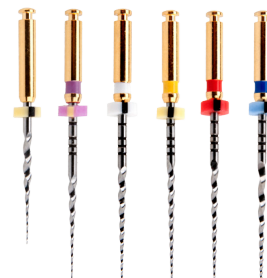
SX S1 S2 F1 F2 F3